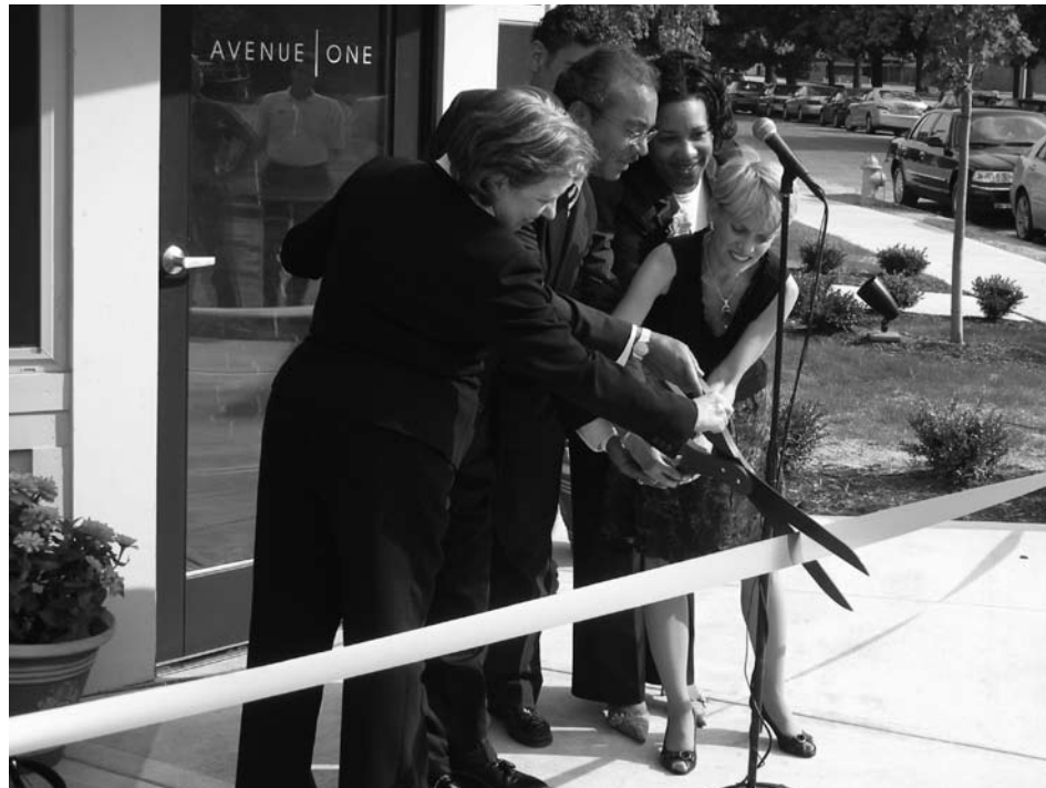
Grand Opening of Avenue One Condos in Harrison West